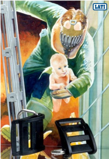
LATAMID 66 H2 G/25-V0KB Belt buckle for breathing apparatus (fire service)

Flame-retardant additives are incorporated into plastics to help prevent a fire or its propagation by interrupting or hindering the combustion process and thus protect lives, property and the environment. Such additives are typically classified as either halogenated or non-halogenated.